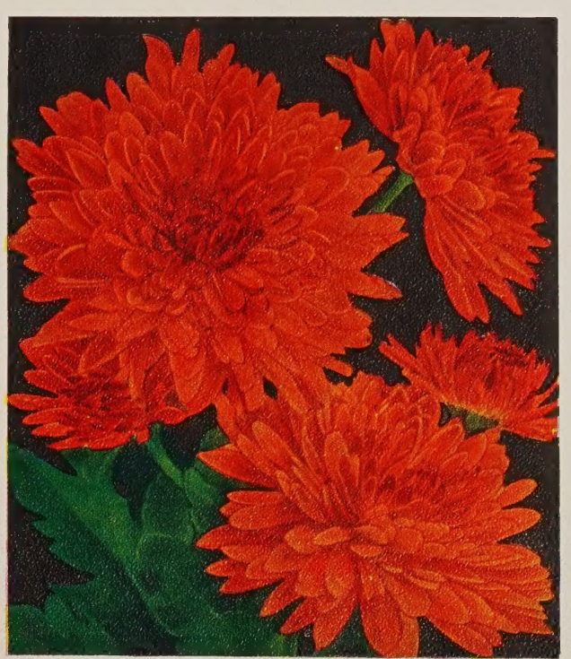
CHRYSANTHEMUM , Indian Summer